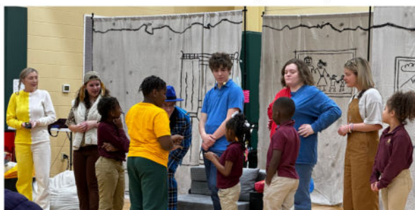
(Left) St. Anthony was the final tour stop for the Market Theatre of Anderson's presentation of "Dragons Love Tacos". Students are seen asking cast members about various aspects of their performance.