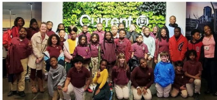
3rd-5th grade visited the offices of Current Lighting (thanks Richard Cade) to learn about the many aspects of the lighting industry and the wide variety of occupations that are available and work together to form their products. (Thanks SJCS for the bus transportation!)