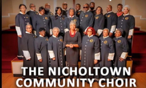
THE NICHOLTOWN COMMUNITY CHOIR

Along with Greenville's Finest Gospel Choir